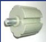
END INSERT CAP ROUND PIN