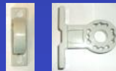
CAST ALUMINIUM POWDER COATED MOUNTING BRACKETS WITH OFFSET SCREW HOLES