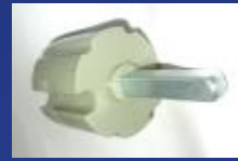
END INSERT CAP SQUARE PIN