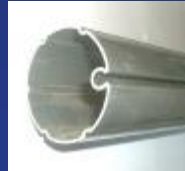
70mm DIA x 5mtr or 6mtr LONG GROOVED ALUMINIUM TUBE FOR SUPERIOR STRENGTH