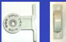
CAST ALUMINIUM POWDER COATED MOUNTING BRACKETS WITH OFFSET SCREW HOLES