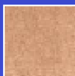
KEA SANZ BEIGE