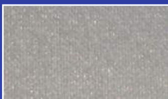
LT GREY 5907