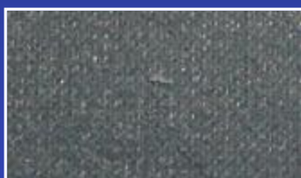
MID GREY 5953